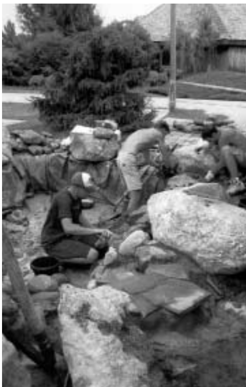
The crew from Blomquist Design setting the boulders of the new waterfall garden.