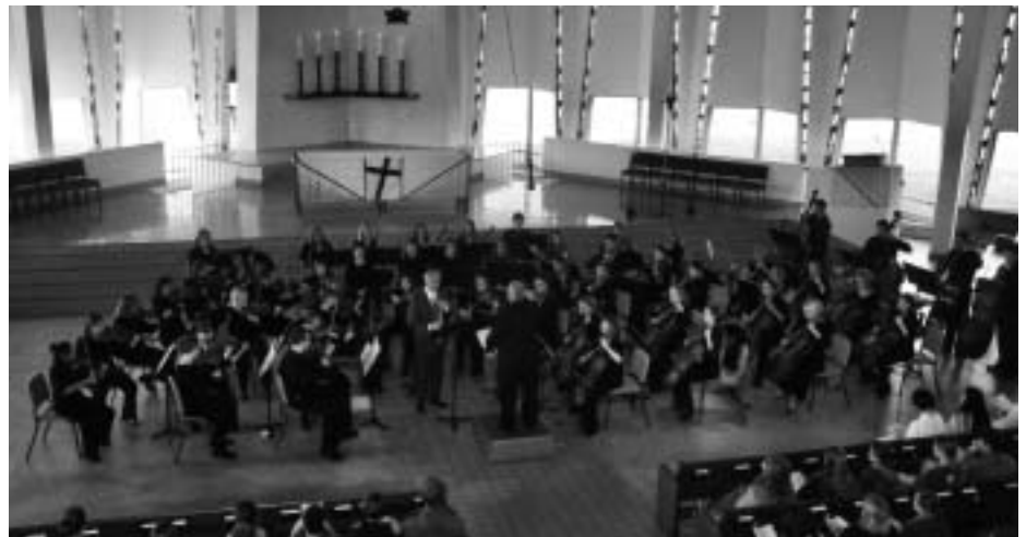
The Gustavus Symphony Orchestra performing Jean Francaix's oboe concerto The Linnaeus Flower Clock during the Arbor Day 2005 Chapel service.