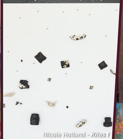
Nicole Holland - Kites I