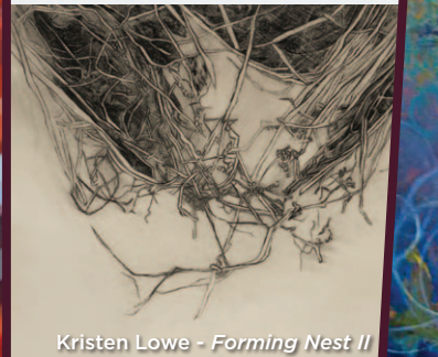
Kristen Lowe - Forming Nest II