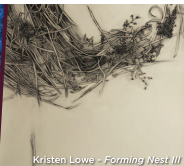
Kristen Lowe - Forming Nest III