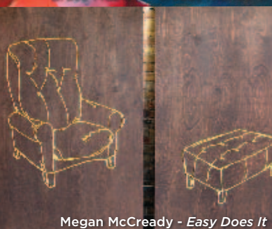
Megan McCready - Easy Does It