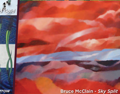
Bruce McClain - Sky Split