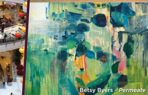
Betsy Byers - Permeate