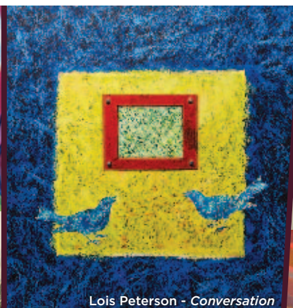
Lois Peterson - Conversation