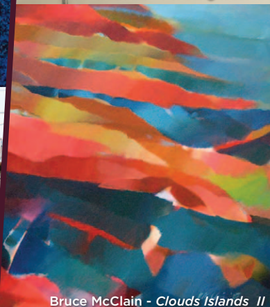
Bruce McClain - Clouds Islands II