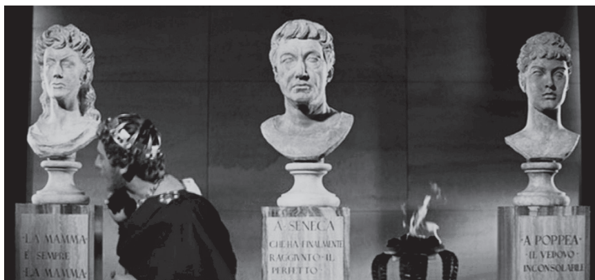
Figure 34. A screenshot of Alberto Sordi as Nero with portrait busts of Seneca, Poppaea and Agrippina, Mio Figlio Nerone (1956).

Speaking of incest and other perversions, one cannot avoid mention of the notorious editor of Penthouse Magazine , Bob Guccione, and his 1979 film, Caligula . 26 Here, unfortunately, we reach a nadir: hardcore pornography amid an orgy of graphic violence. Despite an illustrious cast, an early script written by Gore Vidal, and the protestations of Guccione that his production was